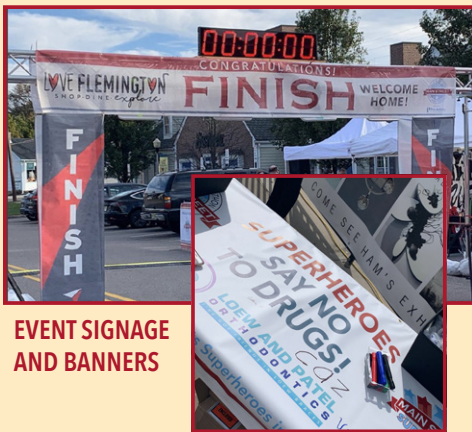
EVENT SIGNAGE AND BANNERS