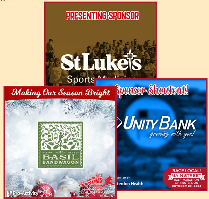
SOCIAL MEDIA MENTIONS, including dedicated or shared post spots and re-shares of your own content with endorsements