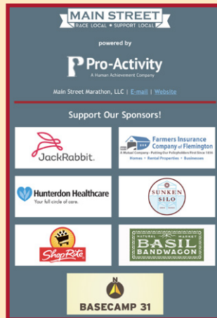
E-NEWSLETTER PLACEMENT with clickable links