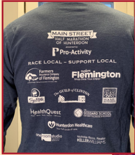
Your Brand on RACE SWAG

Some of the ways we partner with your brand to give you the support your commitment deserves.