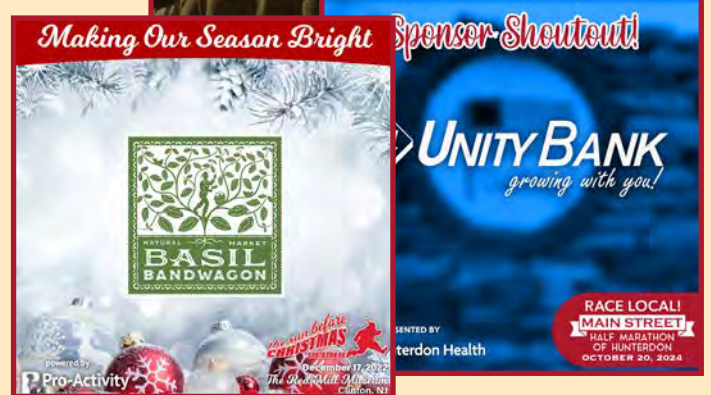
SOCIAL MEDIA MENTIONS, including dedicated or shared post spots and re-shares of your own content with endorsements