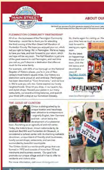
EVENT GUIDE Advertorial Content