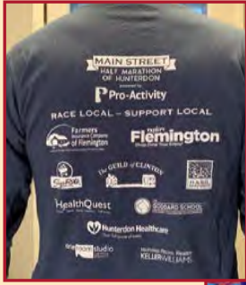
Your Brand on RACE SWAG

Some of the ways we partner with your brand to give you the support your commitment deserves.