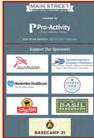
E-NEWSLETTER PLACEMENT with clickable links