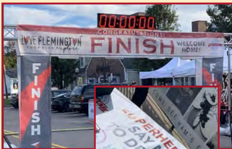
EVENT SIGNAGE AND BANNERS